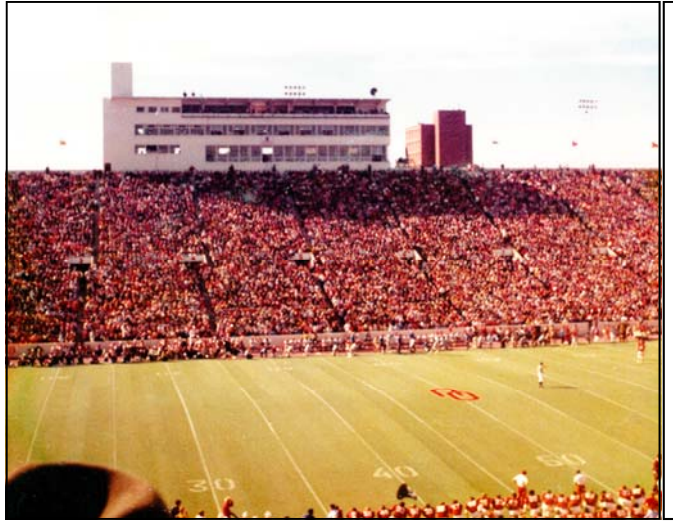
The Owen Stadium expansion at the University of Oklahoma in 1950.