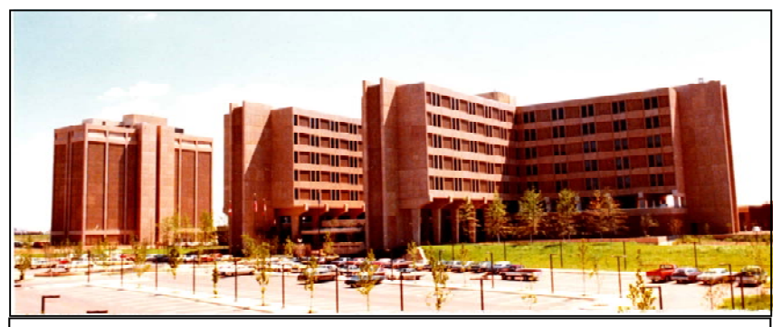
The new Mercy Hospital in the 1970s.

Some of Our Projects from The 1950s, 1960s and 1970s