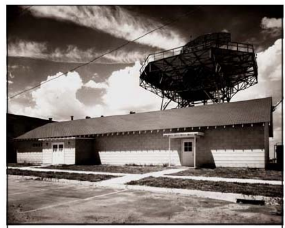
The ARSR-1 radar at FAA in 1959.

Osborne Serving the Community in the 50s, 60s and 70s