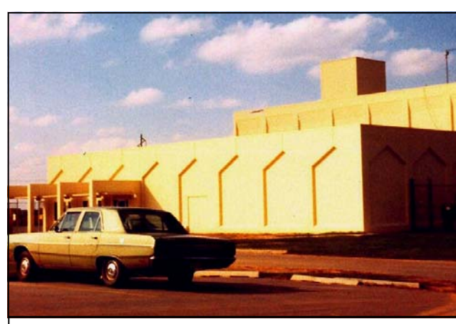
Kerr-McGee plutonium plant in Crescent, Oklahoma, 1972.