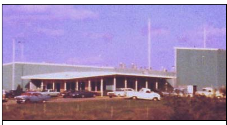
Kerr-McGee uranium plant in Crescent, Oklahoma, 1965.