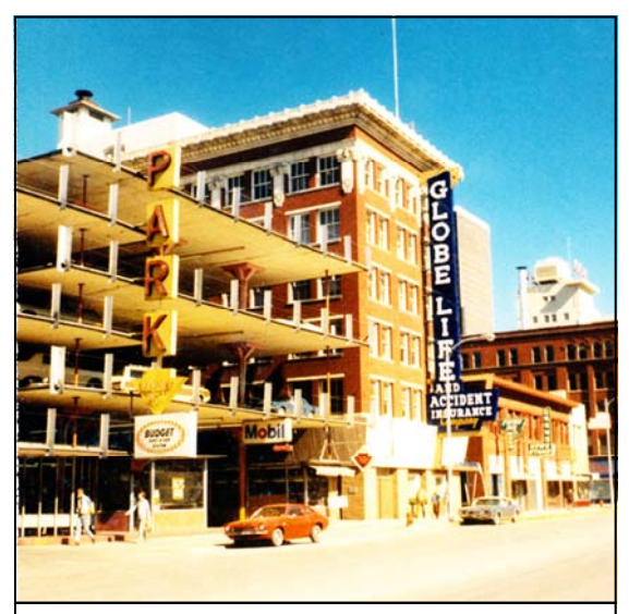
The Globe Life Insurance Building, which we worked on in the 1950s and 1960s. This was formerly the old street car terminal building.