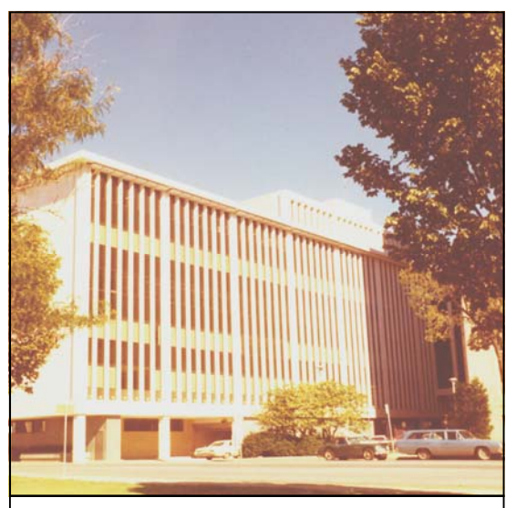
The Oklahoma County Courthouse in 1963.